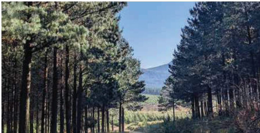
New Forests's portfolio spans 4.5m hectares, with the majority located in developed markets

A key development in natural-capital investing is the growing attention to social as well as environmental impact.